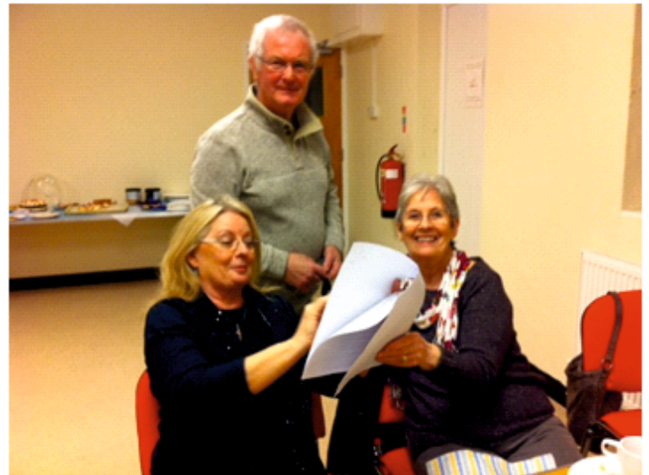
Treharris won the quiz!